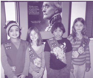
Brownies earn the Susan B. Anthony patch right here at her House.