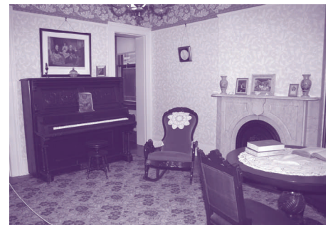
The front parlor, complete with the Washington family portrait over the piano.