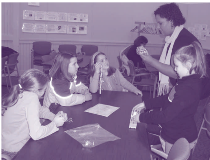
Inspiration Express introduces Girl Scouts to Miss Anthony and her model of civic engagement.